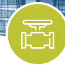
Pumps, valves and pipes