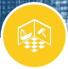
Building Interiors & Finishes