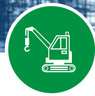
Plant Machinery & Vehicles