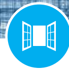
Windows, Doors & Facades