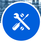
Construction Tools & Building Materials