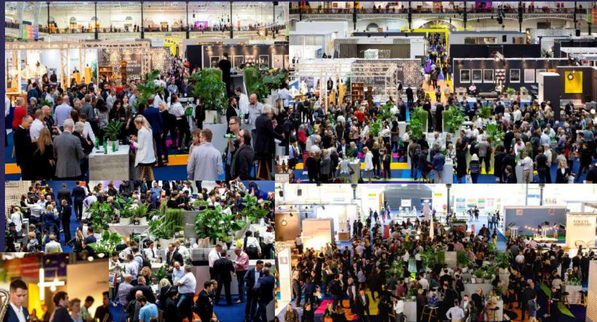
Giving access for visitors to meet exhibitors till late