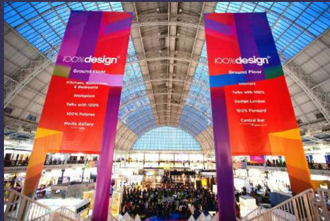
DJs from Fabric alongside live saxophonist