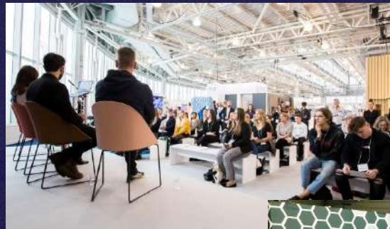
The Forum in Design & Build