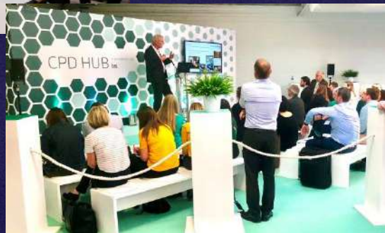
The CPD Hub in Design & Build