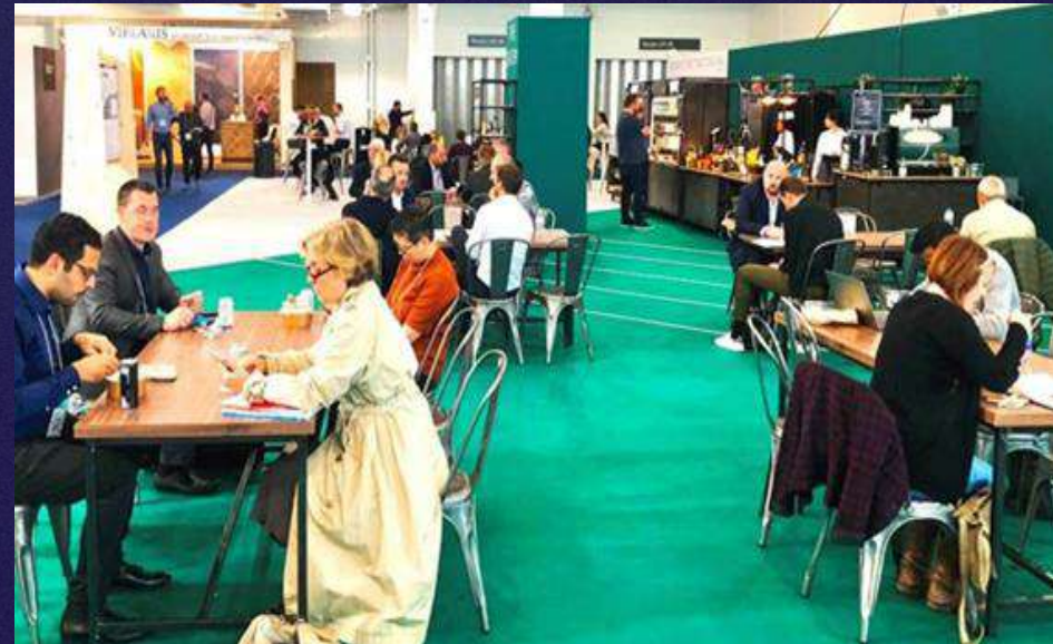
The bespoke main show restaurant in Design & Build